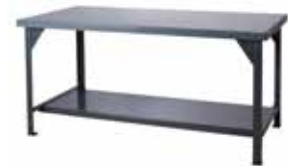
Heavy Duty Workbenches