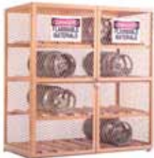
Safety Storage Products