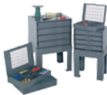
Scoop Compartment Boxes and Racks