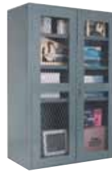
Heavy Duty Clearview Storage Cabinets