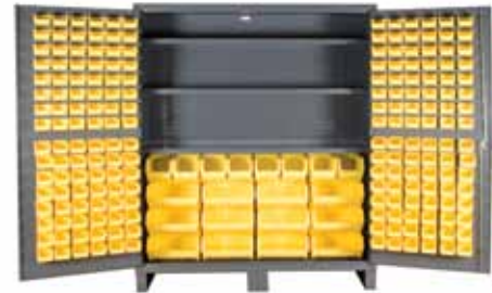
Heavy Duty Bin Cabinets