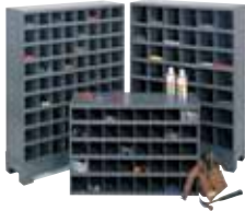
All Welded Parts Bins